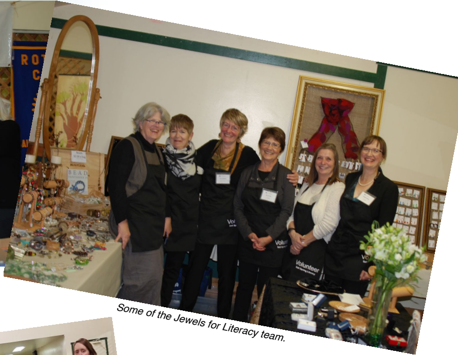
Some of the Jewels for Literacy team.