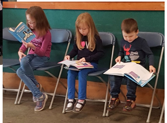
Three happy customers