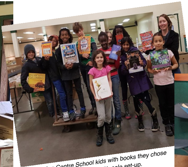
Salt Spring Centre School kids with books they chose after volunteering with sale set-up.